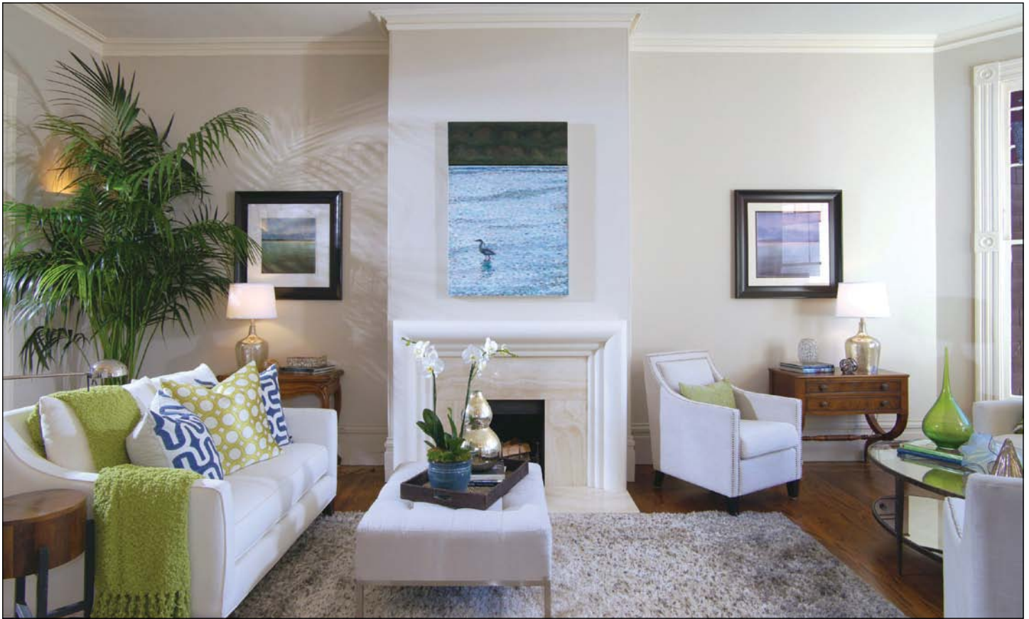
2336 DIVISADERO STREET, SAN FRANCISCO STYLISH PACIFIC HEIGHTS VICTORIAN