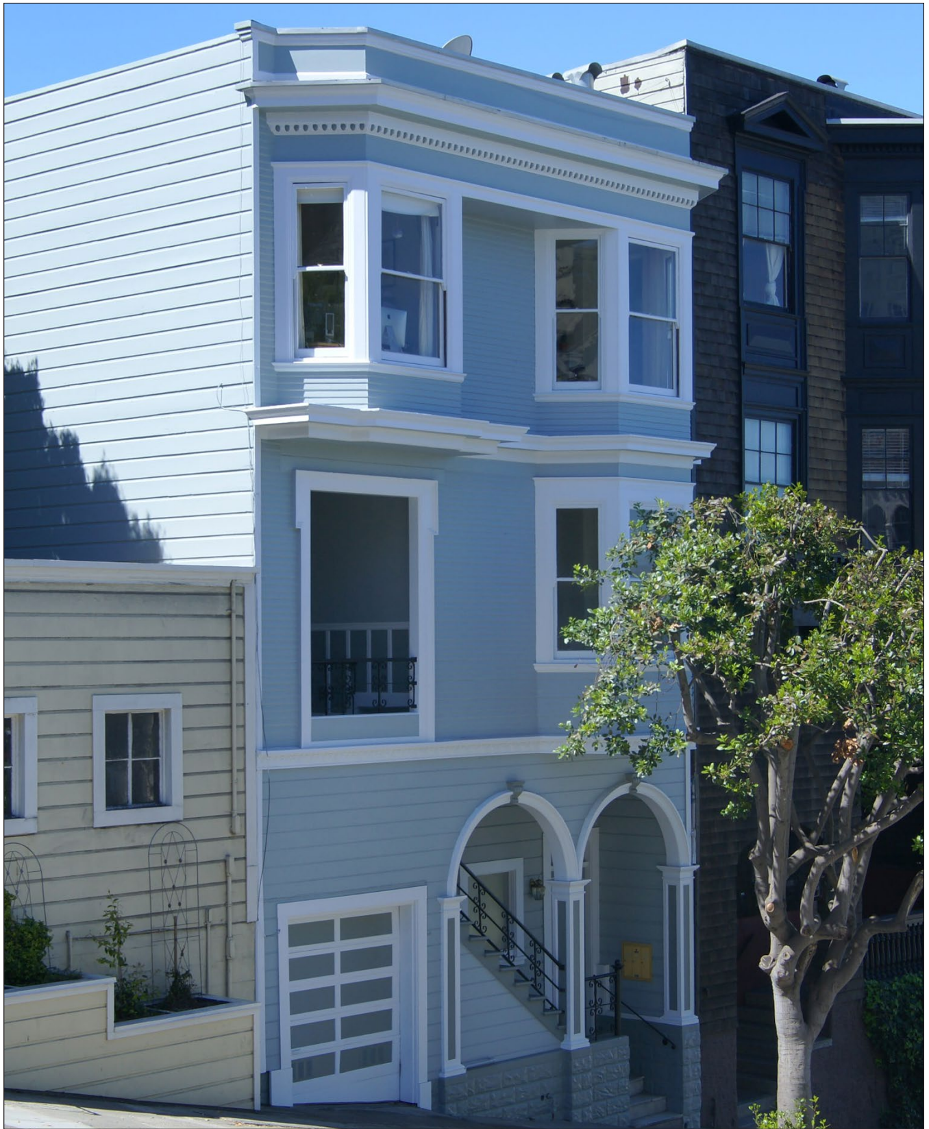
1257-1261 LOMBARD STREET, SAN FRANCISCO CLASSIC FLATS AND GARDEN COTTAGE IN COVETED RUSSIAN HILL