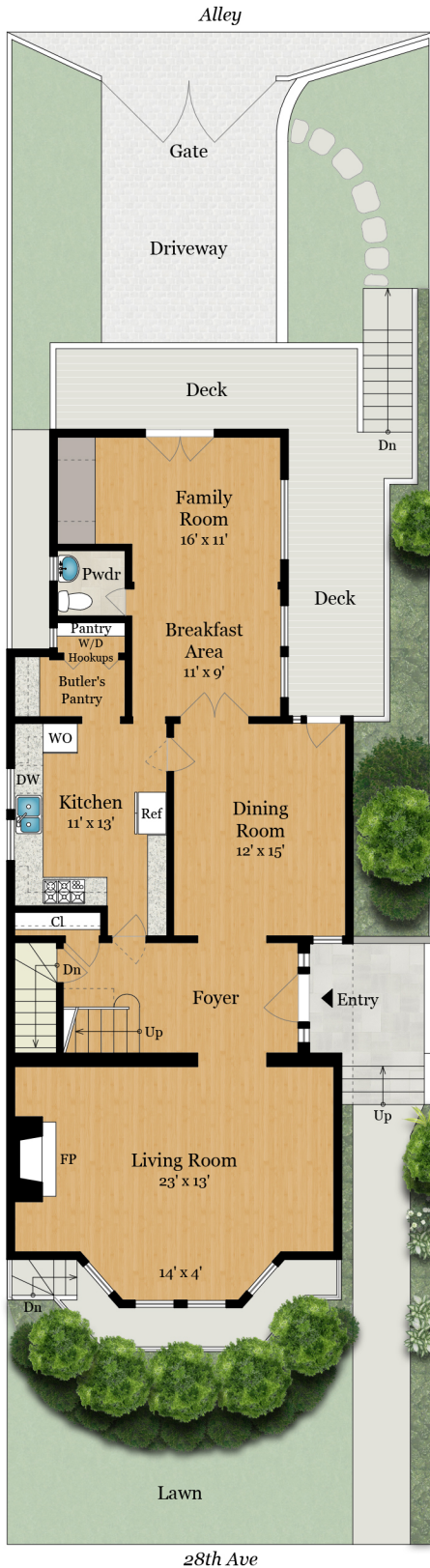
MAIN LEVEL 1,340 SQ FT