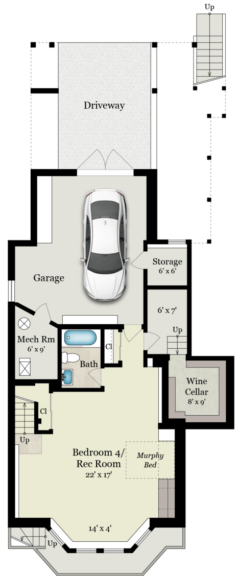
LOWER LEVEL 750 SQ FT - Finished 460 SQ FT - Unfinished

Estimated Total Finished Square Footage: 3,245 SQ FT