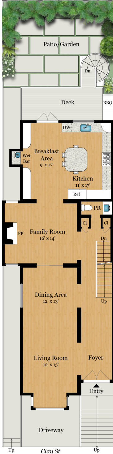
MAIN LEVEL 1,375 SQ FT