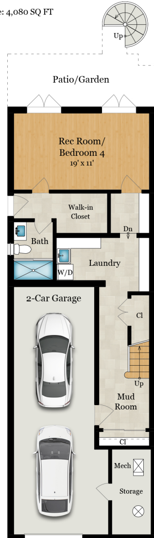
LOWER LEVEL 740 SQ FT